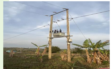
Game Changer: Electricity comes to Kyakitanga!