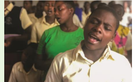
Dignity: 1st ever lunch seated at tables instead of outside in the dirt!