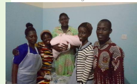
A First: The first baby was delivered at our community clinic this fall