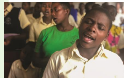
Dignity: 1st ever lunch seated at tables instead of outside in the dirt!