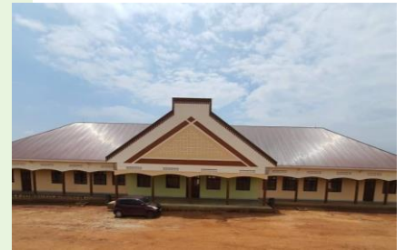
Progress: Our first high school dorm makes space for more students

And do not forget to do good and to share with others, for with such sacrifices God is pleased. Hebrews 13:16