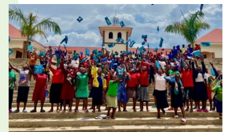
Practical needs: Reusable menstrual kits help girls stay in school all month long