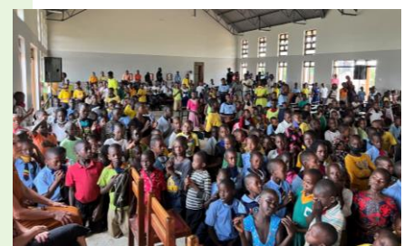
So many lives touched: Over 700 students between the 3 schools